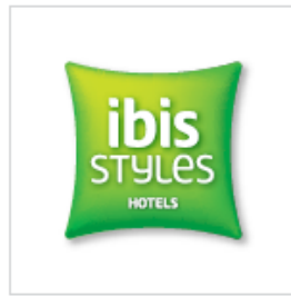
Pictures about the accommodation: Ibis Styles Budapest City *** Superior